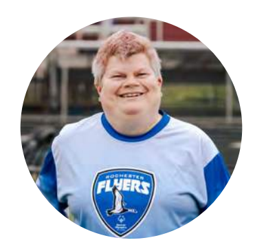
5,729 ATHLETES ENGAGED