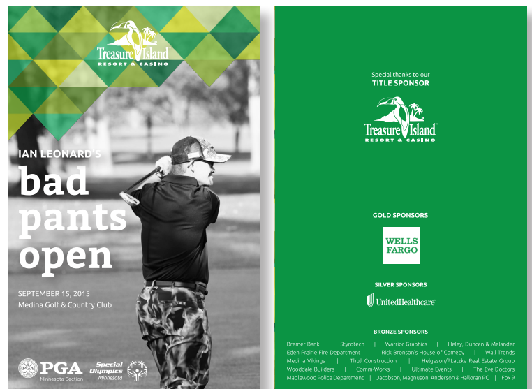
Example of event program with Gold, Silver and Bronze sponsors listed on back.